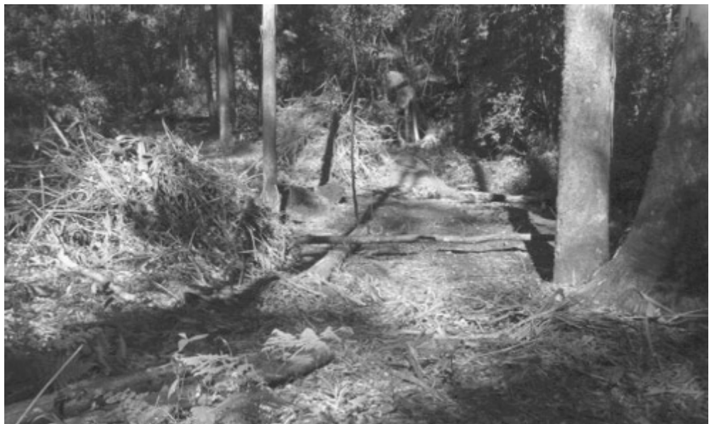
Lantana scraped into piles, exposing rainforest understorey species and tree seedlings. [Di Collier]

Our basic strategy is to attack each area in a manner that requires the least disturbance, either mechanical or chemical. As a general rule we find that pulling lantana by hand produces the best result. The ground is not disturbed so subsequent weed invasion is not such a problem and any emerging native seedlings are not disturbed. Removal by hand seems to be more thorough than other methods and less follow-up is required. The instant gratification from this method is very motivating, as you see the land being restored before your eyes. The major downside to hand pulling is that it is very labour intensive.