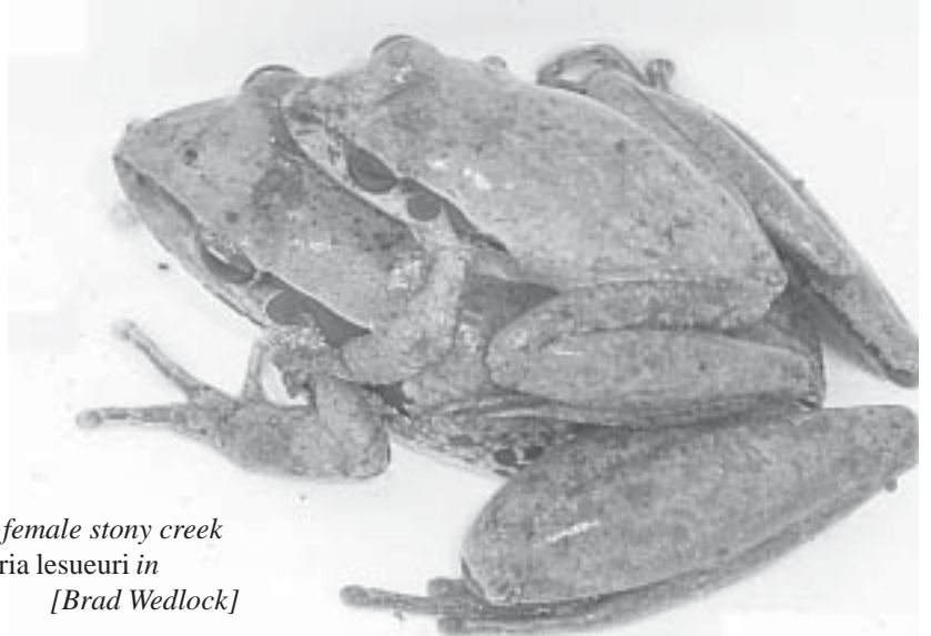
Male and female stony creek frogs Litoria lesueuri in amplexus [Brad Wedlock]

When we are surveying for frogs we go out at night starting at dusk. During and after rain is best for most frog species. Frogs can be located by searching for 'red eye' with a headlamp. This is