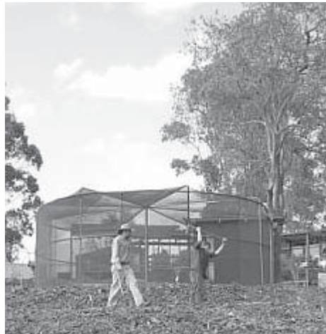
The Butterfly House under construction

In-house plantings will mimic a range of habitats, from rainforest to open forest and plains. Caterpillar food plants will be potted so they can be rotated and rested outside to prevent individual plants from becoming over-eaten.