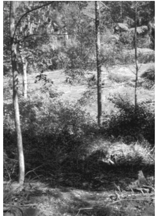
The view down into Lantana World, where the battle front divides cleared land (centre) from rainforest (at top). [Di Collier]

Waging War on Weeds is a huge commitment both of resources and troops because it is essentially a war without an end. However the satisfaction of repelling the invaders and slowly reclaiming territory for native plants and animals is immeasurable. Now after little more than two years of combat we have extensive natural re-growth and are enjoying previously inaccessible areas of our property.