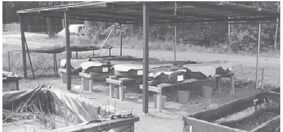
Worms at work, converting cabomba into something that may be of use

What do you do with 90 tonnes (per hectare) of cut Cabomba ? Cabomba contains up to 14 per cent protein, but because cabomba accumulates heavy metals (manganese, magnesium and lead in particular) the harvested material