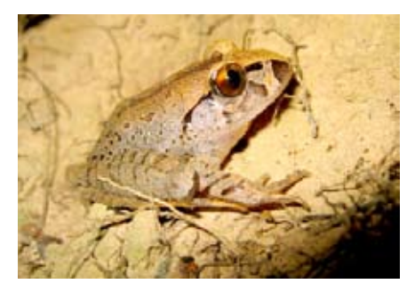
Giant barred frog (juvenile)

We have concentrated on waterway-dependant flagship species, such as the Mary River cod and Mary River turtle, Australian lungfish, giant barred frog, cascade treefrog and tusked frog. More recently, the vulnerable Richmond Birdwing Butterfly has joined the ranks as its recovery is intrinsically linked to the protection and re-establishment of its host