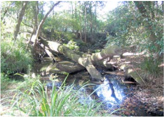
Good stream-frog habitat

We didn't hear a single great barred frog or cascade tree frog sending out its mating call, unless enticed by evening intruders with CD players.