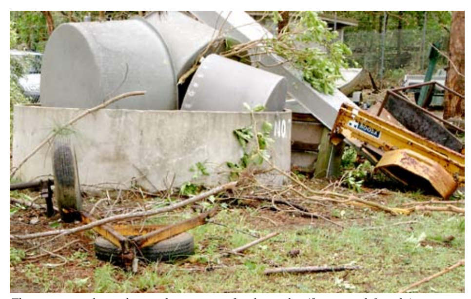
The rearing tanks made it in, but no room for the trailer (foreground & right).

Thanks also to the Council people who had to come out at night weeks after the