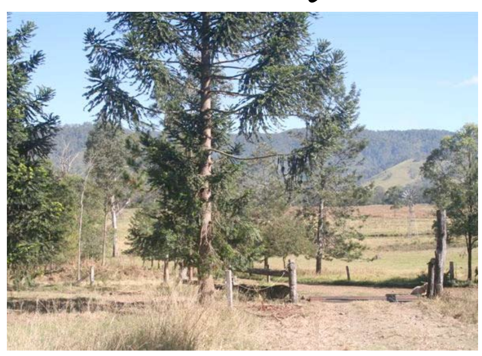
Managing for sustainability is transforming the landscape for both business and wildlife at Peter and Elke Watson's dairying property near Conondale.

The two kilometre stretch of Mary River frontage was fenced off in 1991. We have enhanced the pioneer colonisation by sheoaks by planting native trees in a five to ten metre strip along the top of the bank. This vegetation has made the bank stable, even in very large floods. In the record flood in 1999, only a minimal amount of riverbank was lost – just a strip 1.5 metres wide along a 10 metre