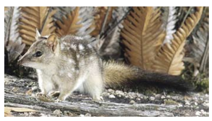
Northern quoll.

Among genetic effects associated with the small