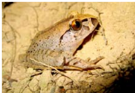
Giant barred frog (juvenile)

We have concentrated on waterway-dependant flagship species, such as the Mary River cod and Mary River turtle, Australian lungfish, giant barred frog, cascade treefrog and tusked frog. More recently, the vulnerable Richmond Birdwing Butterfly has joined the ranks as its recovery is intrinsically linked to the protection and re-establishment of its host