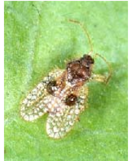
The leaf-sucking tingid bug Carvalhotingis visenda (approx. 2 mm) will be taking on cats claw creeper in the Mary catchment.

Stage 1 of the releases will encompass Cooloola, Noosa, Kilkivan, Tiaro and Woocoo Shires. Negotiations are currently underway with other Shires and private landholders who will be invited to participate in Stage 2.