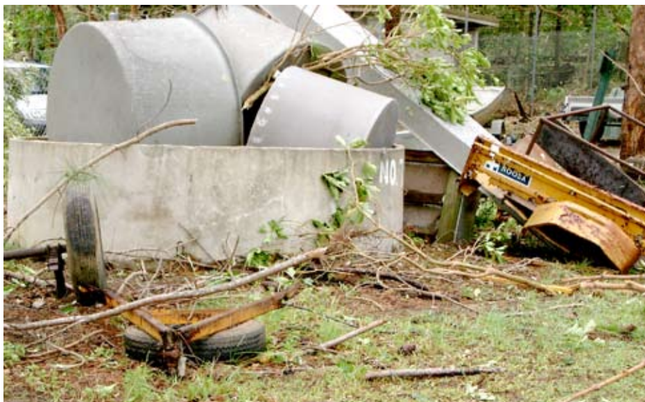
The rearing tanks made it in, but no room for the trailer (foreground & right).

Thanks also to the Council people who had to come out at night weeks after the