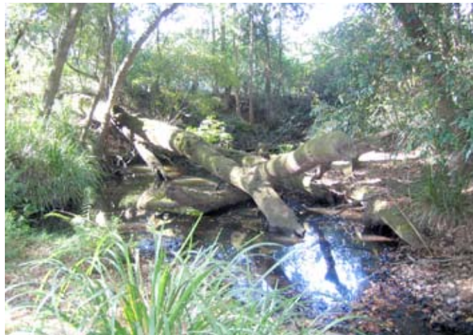
Good stream-frog habitat [Eva Ford]

We didn't hear a single great barred frog or cascade tree frog sending out its mating call, unless enticed by evening intruders with CD players.