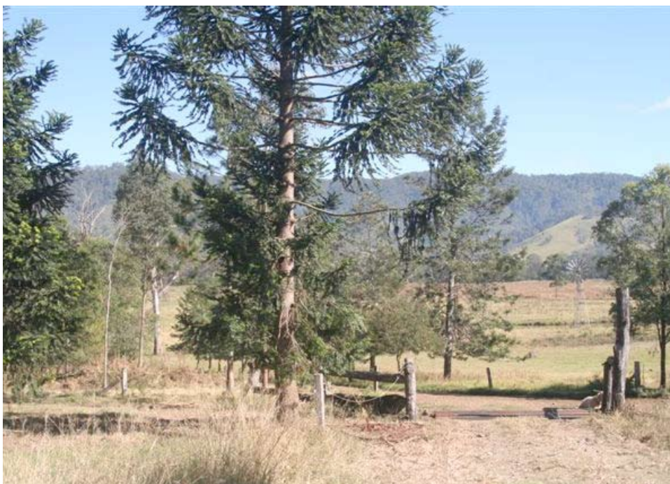
Managing for sustainability is transforming the landscape for both business and wildlife at Peter and Elke Watson's dairying property near Conondale.

The two kilometre stretch of Mary River frontage was fenced off in 1991. We have enhanced the pioneer colonisation by sheoaks by planting native trees in a five to ten metre strip along the top of the bank. This vegetation has made the bank stable, even in very large floods. In the record flood in 1999, only a minimal amount of riverbank was lost – just a strip 1.5 metres wide along a 10 metre