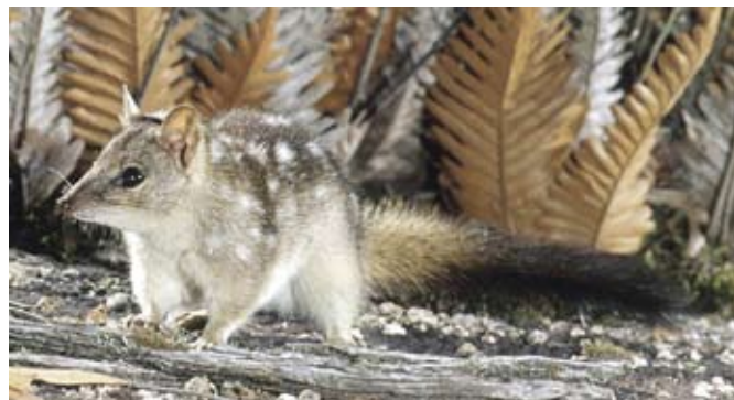
Northern quoll.

Among genetic effects associated with the small