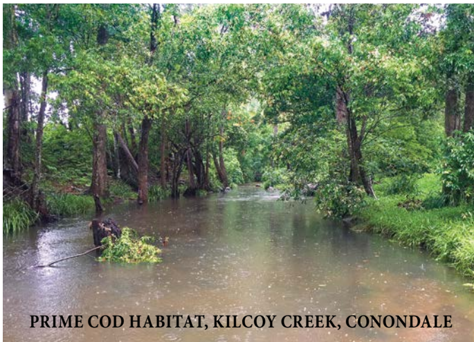
PRIME COD HABITAT, KILCOY CREEK, CONONDALE

The Mary River cod is an ambush predator, darting out from a cover of sunken logs and undercut banks, swallowing passing prey whole. Their diet mainly consists of shrimps, fish and crayfish. They have also been known to eat water fowl, water rats and water dragons.