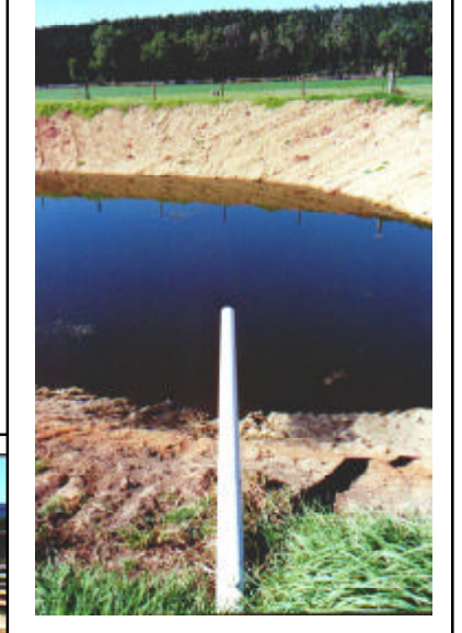
Above: Wastewater from dairy piped down to effluent pond

Above: Dairy holding yard Right: Effluent pond