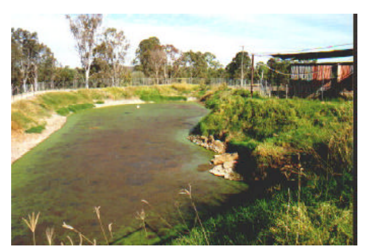
Above: Effluent pond

This work was conducted at a cost to the landholder of $12 524 of in-kind labour and materials, along with a grant of $3 000 from the Dairy Effluent Scheme.