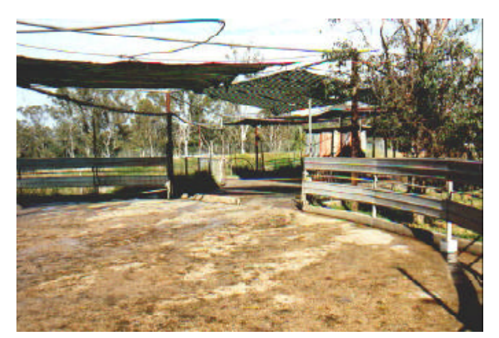
Above: The dairy holding yards