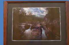
Win a Bob Simpson Photo and Native Bee Book