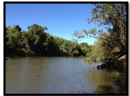
Mary River downstream of Gympie